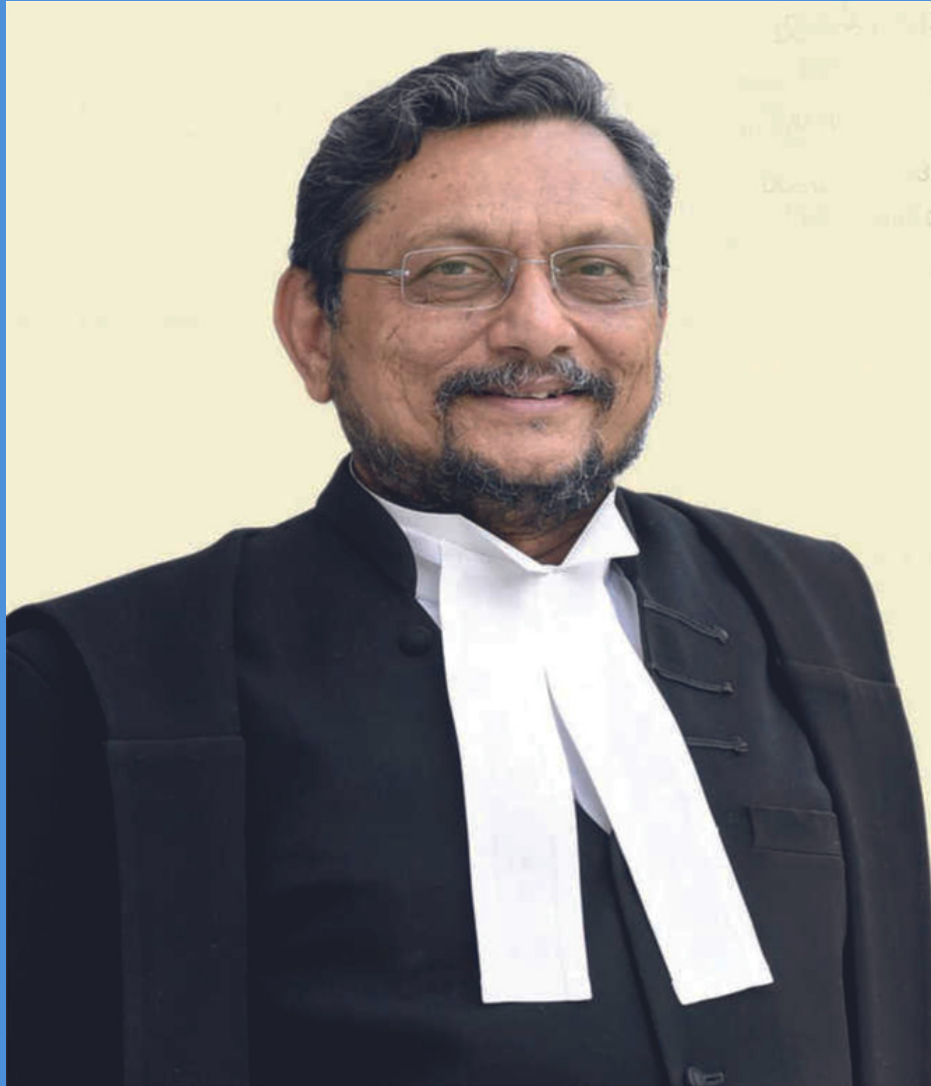
Justice Shri Sharad Arvind Bobde Hon'ble Chancellor MNLU Mumbai