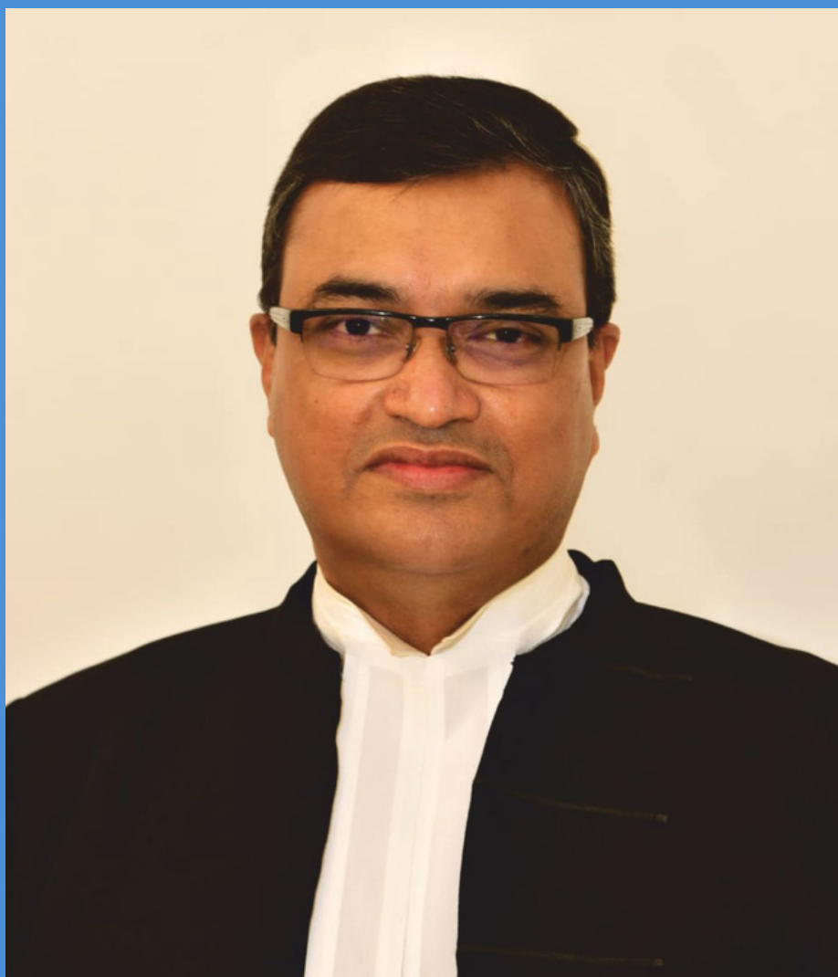
Justice Shri Dipankar Dutta Hon'ble Pro-Chancellor MNLU Mumbai